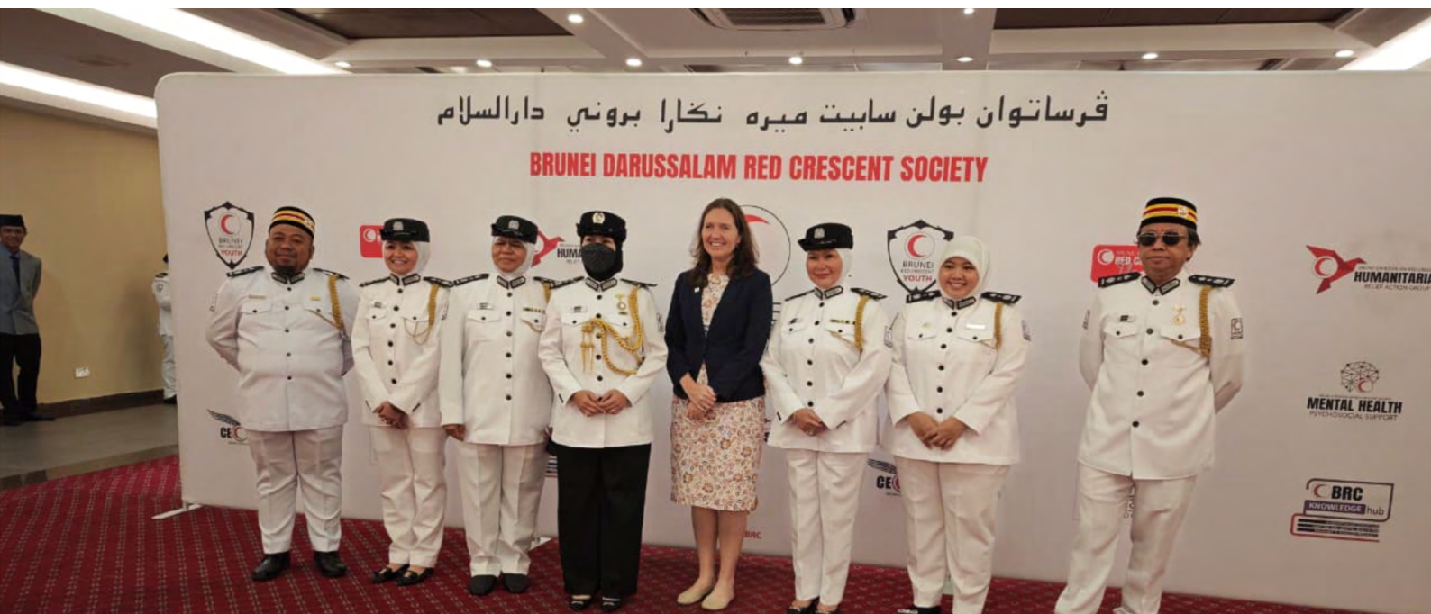
Brunei Darussalam Red Crescent Society Governing Board with IFRC during its Annual General Meeting (AGM) to discuss progress of 2025 activities and priorities for 2026.

In the area of governance, the National Society will continue to align with the Fundamental Principles of the Movement, focusing primarily on the adaptation of a constitution that will involve drafting and consultation with the IFRC and the ICRC, with a priority on finalizing the by-laws. Registering the constitution by law will be another key element of the adaptation process. The National Society will also prioritize capacity building, encompassing training, learning, skills and knowledge enhancement, coaching, support and development.